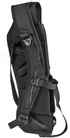
Folds in half (small packing size)